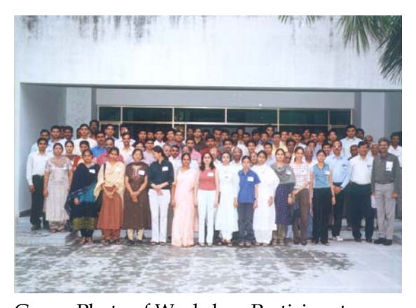
Group Photo of Workshop Participants