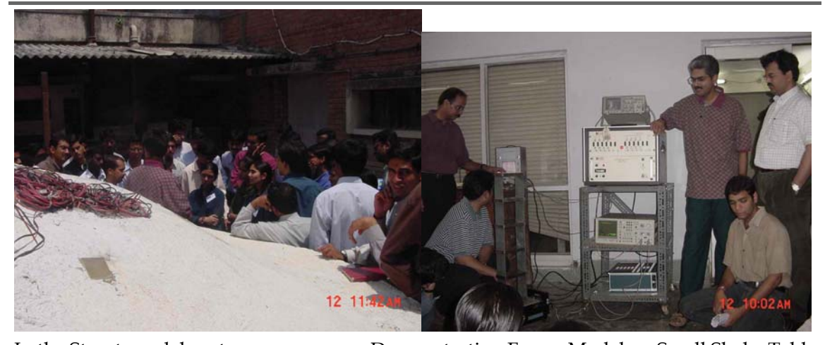
In the Structures laboratory...