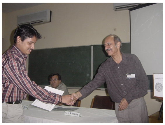
Workshop Certificates Distribution...