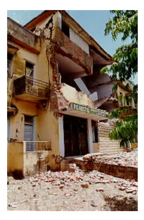
Figure 4 - Load-bearing brick masonry structures on the campus of Jawaharlal Nehru Agricultural University in Jabalpur were badly damaged.

In the urban area, the maximum damage was experienced at the Jawaharlal Nehru Agricultural University campus in the Adhartal area of Jabalpur. The laboratory buildings and residential quarters were load-bearing brick masonry structures. The damage varied from traditional diagonal cracks in walls to partial collapse of buildings. The failures are attributed to the weak cement masonry walls and poor connection between the walls. The severe damage to the post-graduate students' hostel building is shown in Figure 4 .