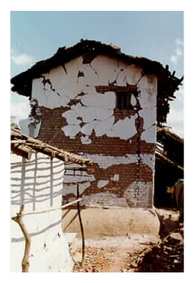
Figure 3 - In rural and urban areas, houses are built using a single wythe of burnt brick with mud mortar. Buildings of this type suffered significant cracking.

Some houses in rural as well as urban areas are built with burnt brick masonry in mud mortar. Unlike the traditional construction practice, the mud mortar is not reinforced with straw in this type of construction. Most structures of this type are one or two-story buildings whose walls are a single brick thick (230 mm). These structures sustained significant cracking ( Figure 3 ).