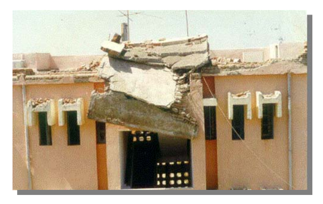
Figure 5 - Many staircase towers, called "mumty," which project about 2 m above the surrounding construction in masonry houses, collapsed.

it. Vertical projections in houses (for example, chimneys) are known to be particularly prone to damage during earthquakes, and extensive damage to mumty is a clear indication of this behavior.