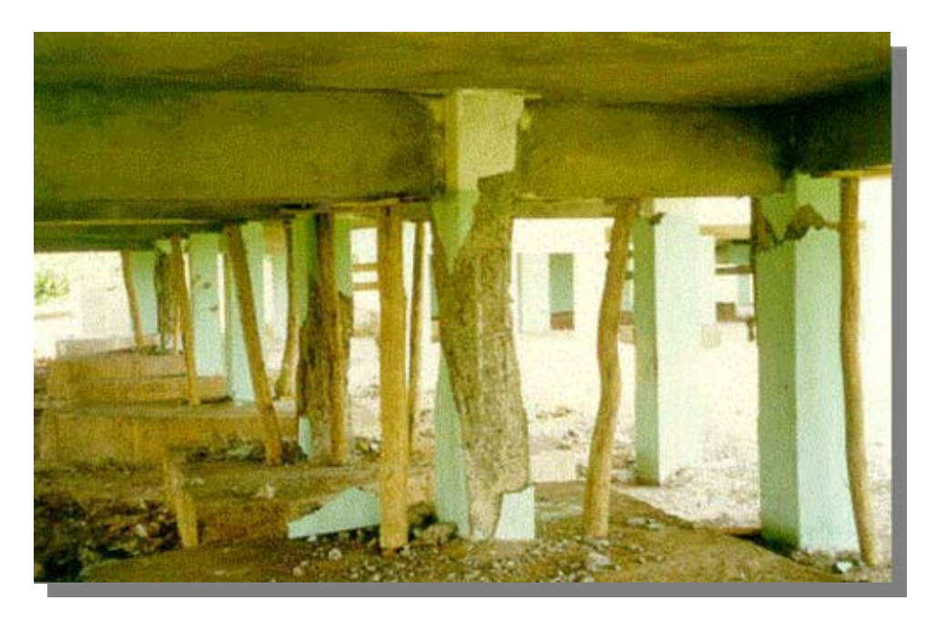
Figure 7 - Built on piles and stilt columns on the site of a previous pond, the new, still unoccupied Youth Hostel in Jabalpur suffered serious damage to its stilt columns.

3. Youth Hostel Building in Jabalpur. This is a C-shaped RC frame building built by the Central Public Works Department but not then occupied. It is located in the Ranital area of Jabalpur. The building is located where there originally was a pond. It is supported on piles, pile caps, and stilt columns. Above the stilt columns are two stories with brick masonry infill. The damage is concentrated only in the stilt columns; severe cyclic shear cracking in many columns was observed ( Figure 7 ). The soft story at the stilt level is clearly the primary reason for such severe damage.