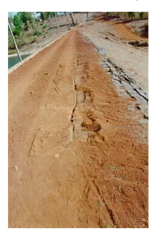
Figure 10 - Longitudinal cracks appeared along the crest and downstream face of several earthen dams.

There are quite a few irrigation structures in the area. The concrete gravity dam at Burgi did not show any damage. However, a number of earthen dams located in the districts of Jabalpur and Mandla were reported to have developed longitudinal cracks. The team visited two such dams: the 16.9-m-high earth dam at Mahgaon (30 km east from Jabalpur), and the 29-m-high Matiyari dam (95 km southeast of Jabalpur). Both suffered longitudinal cracks along the crest and the down-stream face ( Figure 10 ). These dams are made of the locally available black cotton soil, which is known for its high shrinkage characteristics in dry conditions. The intensity of shaking at village Mahgaon was about VII on the MSK scale, while that at Matiyari dam was about VI.