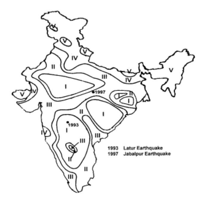
Figure 2 - Seismic zones used by the Indian seismic code.

The earthquake did not manifest itself in visible deformation features of the ground. No surface trace of rupture was noticed. There were no instances of liquefaction during the earthquake. Longitudinal cracks in the ground were seen in some locations in the affected area. White fumes resembling steam were reported to have escaped from the ground in the village Ghana, near Khamaria, situated about 12 km northeast of Jabalpur. A very large number of persons reported earthquake sound, with occasional "blastlike" noise. A few persons also reported "earthquake lights" during the shaking.