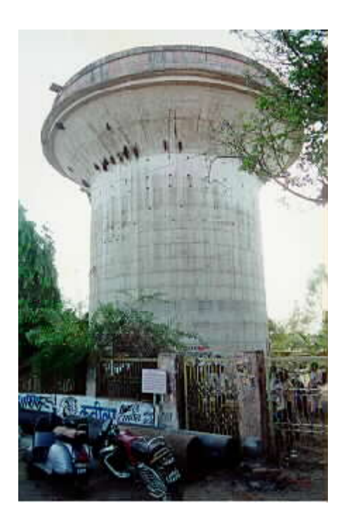
Figure 9 - Horizontal and diagonal cracking occurred at the base of the 500,000 gallon shaft-supported water tank.