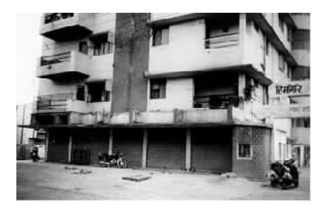
Figure 6 - The columns in the ground story parking area of the Himgiri Apartment Buildings, a five-story reinforced concrete building with brick infill, suffered shear failure.

1. Himgiri Apartment in Jabalpur. This is a five-story RC frame building with brick infill located in the "Wright Town" area of Jabalpur. There are shops on two adjacent faces of the building at the ground story with brick masonry partition walls ( Figure 6 ). The remaining corner of the building on the ground story is meant for parking and hence is "open," i.e., with no walls. The columns in the ground story in the parking area were badly damaged; shear failure of columns, opening of transverse ties, and buckling of longitudinal reinforcement bars occurred. There was only nominal damage in the upper stories consisting of cracks in the filler walls. This is a clear case where the columns were damaged as a result of the "soft first-story" effect. Moreover, loading on these columns may have increased through the torsion effect caused by higher lateral stiffness on the other side due to filler walls in the shops.