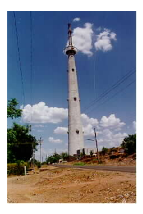
Figure 8 - No damage was observed to the 225 m high RC and steel TV tower in Katanga.

A 175m high radio transmission guyed mast is located in the Karmeta area of Jabalpur. After the earthquake, small amounts of kinking (about 0 02') in the steel frame were observed at the higher connections of the guys.