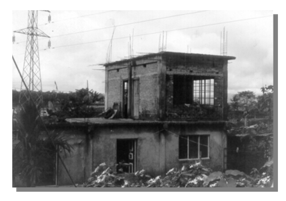
Figure 3: R.C. Frame Building in Siliguri with 'Lintel Band'