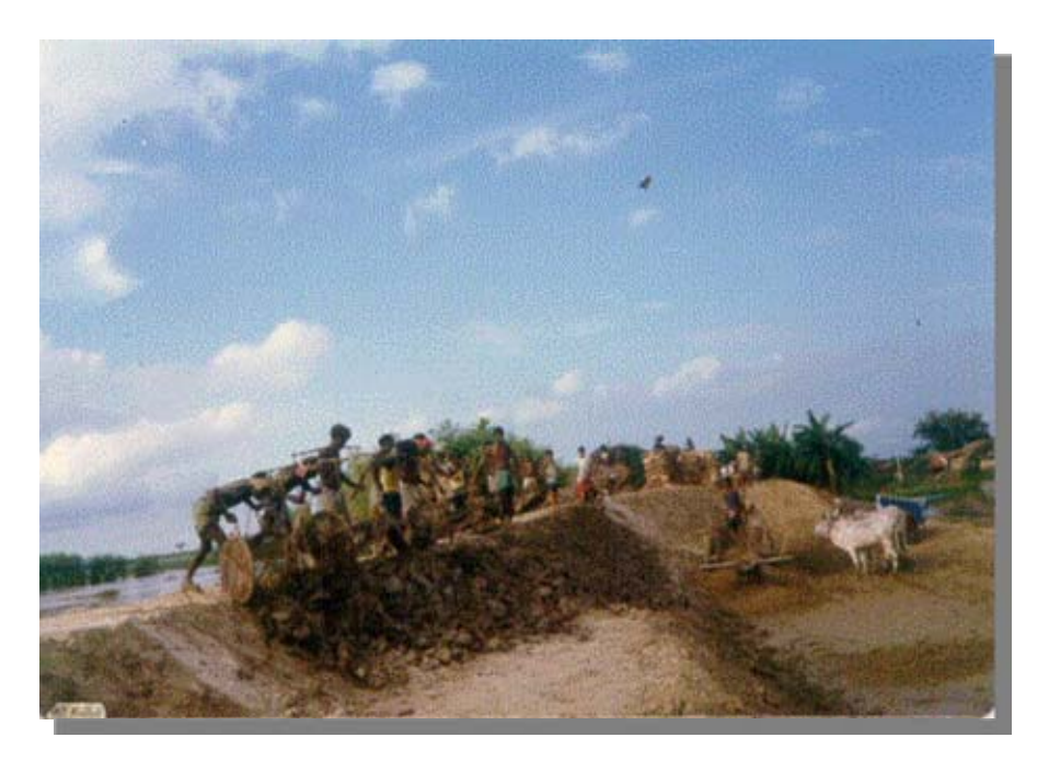
Figure 2 : Restoration of a subsided embankment without any compaction

but the builders lack proper training and hence misunderstand the code provision of lintel band in masonry load bearing construction as noted by it being applied to filler walls in frame buildings.