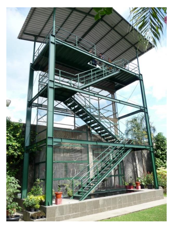
Figure 3. A private tsunami evacuation center. Most evacuation centers are for the nearby community.

The primary requirement of a tsunami shelter is to accommodate evacuees above the expected inundation level. As far as the structural design properties of a shelter are concerned, it must first be designed to resist earthquake forces from ground shaking. This means it must be designed to a higher standard than usual. It must also comply with every code requirement to ensure its earthquake safety. Then it must be checked it can withstand the considerable water pressures plus impact forces from water-borne debris.