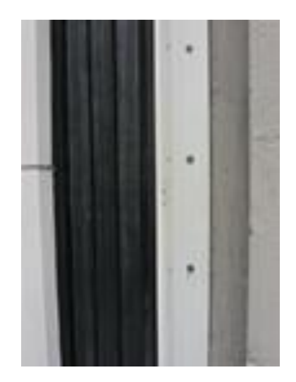
Figure 5. A close-up of the flashing covering the seismic gap.

It is very difficult to prevent pounding between existing buildings with narrow separation gaps or none at all during a strong earthquake. If the floor levels of adjacent buildings align, the pounding of floor slabs against each other is less serious than where floors of adjacent buildings are not at the same level. In this case, the floor slabs of one building can seriously damage adjacent columns of the other building. One solution is to provide new 'back-up' columns in case the outer and more vulnerable columns are damaged.