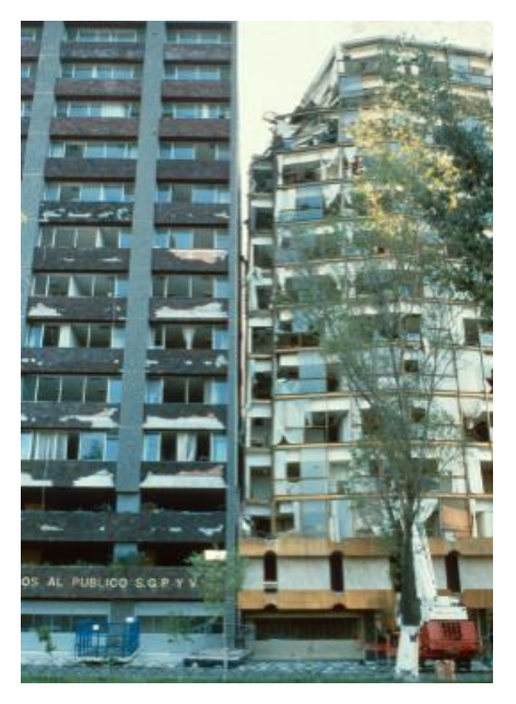
Figure 2. Two buildings have pounded each other with one far more seriously damaged than the other.

Figure 1. Two buildings with an insufficiently wide seismic gap pounding each other during an earthquake.