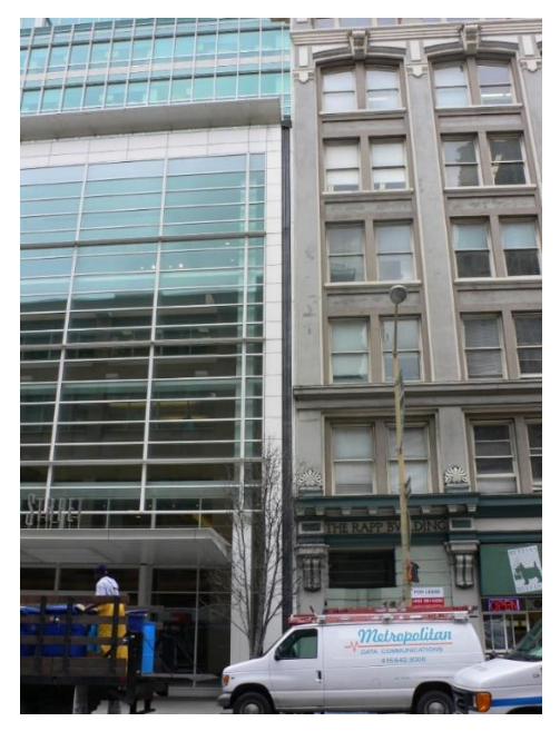
Figure 4. Two buildings separated by a seismic gap covered by a flexible flashing.

How wide do these gaps, usually referred to as "seismic separation gaps", need to be? It depends on the building's height and its flexibility. For the most flexible building allowed by earthquake codes the gap to the boundary is about 2% of the building height. For a four-story building this is about 240 mm. A narrower seismic gap is feasible if the civil engineer designs a stiffer building; for example, with larger columns and beams, or longer structural walls. When adjacent buildings are closeby, gaps are covered by flexible flashings (Figures 4 and 5).