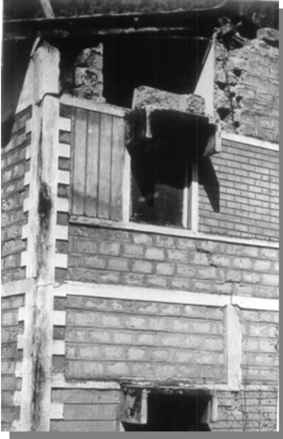
Figure 4: Damage to Gable Wall -Maneri Hydel Project Colony