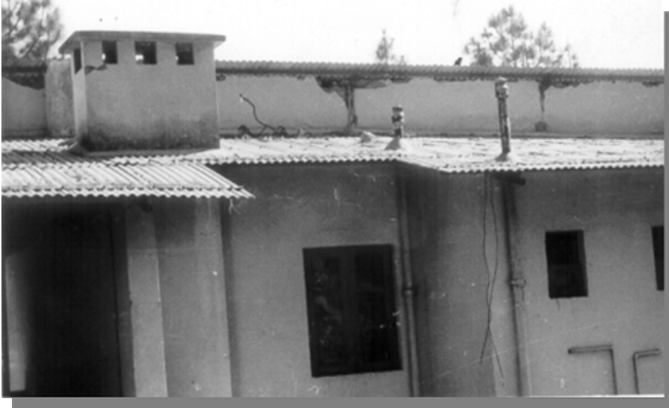
Figure 3: Damage to wall supporting Split Level roof - ITBP campus, Mahidanda.

RC lintel bands, but no roof bands or gable bands. The construction is about 10 years old. The damage to buildings consisted of (I) diagonal cracks below window sills, (ii) damage at the connection between masonry walls and RC roof slabs, (iii) in buildings with corrugated iron sheet roofs, damage at seat of purlins on the gable end walls, and (iv) damage to walls supporting roofs at different heights at either end ( Figure 3 ). Roof and gable bands would have prevented damage of types (ii), (iii), and (iv) above.