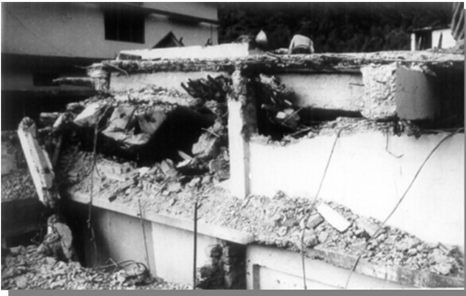
Figure 2: State Bank Building at Uttarkashi

Figure 2 shows the State Bank building in Uttarkashi. During the earthquake, the upper two stories collapsed on the first story. Informations from the local residents revealed that the building was first constructed as one story only; the upper two story was added subsequently. The beams has only two normal rebars on the top face near the column joint and those were incorrectly placed.