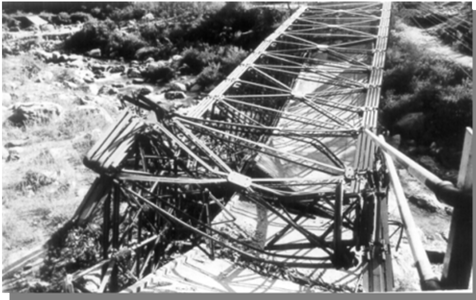
Figure 5: Collapsed Gwana bridge

The Gawana Bridge is a 56.0 m span steel truss bridge build in 1974. It is located at 6km from Uttarkashi towards Maneri. The entire bridge came off the abutments and fell into the river ( Figure 5 ) causing the entire area beyond Uttarkashi to be cut off from the rest of the country. Inadequate design of the bearings and anchor bolts as well as absence of any suitable means of preventing the span from falling off the supports were responsible for the damage.