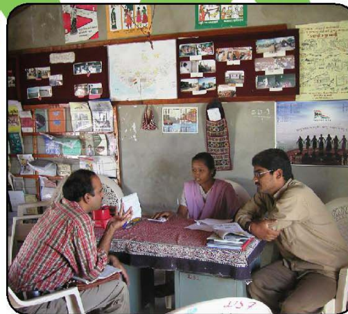
Gujarat (2001 Gujarat Recovery Reconnaissance Team)

The nonprofit organization offers many opportunities for earthquake professionals to stay current in the field through a monthly newsletter, quarterly journal, technical seminars, many of which are available online, and web reports.