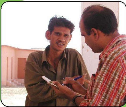
Gujarat (2001 Gujarat Recovery Reconnaissance Team)